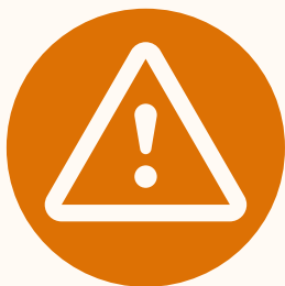
Attitude to Risk & Failure