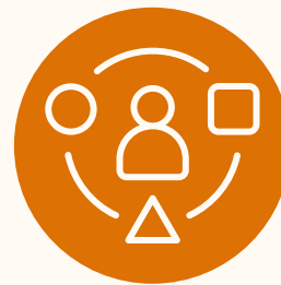
Inclusion & Diversity