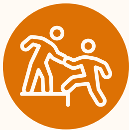
Willingness to Help